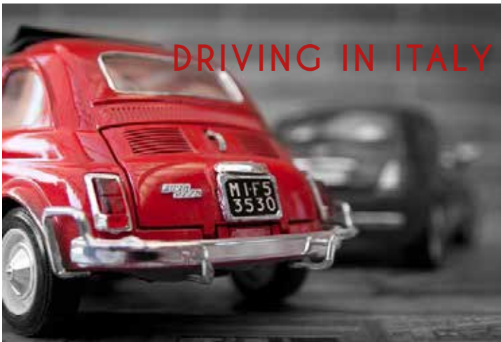
Unforgettable moments driving your vintage car

For any details about driving in Italy we recommend to visit the link of ACI (Automobile Club of Italy) , where you can find all the rules to drive in Italy (English version):