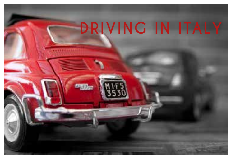
Unforgettable moments driving your vintage car

For any details about driving in Italy we recommend to visit the link of ACI (Auto mobile Club of Italy) , where you can find all the rules to drive in Italy (English version):